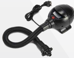
ELETTRIC PUM 25 kpa (250mbar/3,6 p.s.i) 230V - 50Hz 1000 W